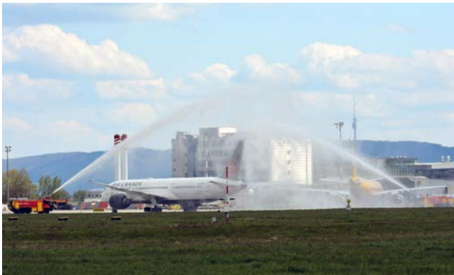
Airport Fire Department welcoming the Boeing 787-900 Dreamliner

On 14 April 2021, Air Canada Cargo lands at EuroAirport for the first time, opening the new transatlantic cargo connection between Toronto and Basel-Mulhouse. This marks the first transatlantic cargo connection since the termination of Swissair and Swissair Cargo activities at EuroAirport in the early 2000s. The new cargo route is flown by a Boeing 787-900 Dreamliner, next-generation long-haul aircraft known for its fuel efficiency and low noise emissions. For the flights from EuroAirport, a normal passenger version of the aircraft is used.