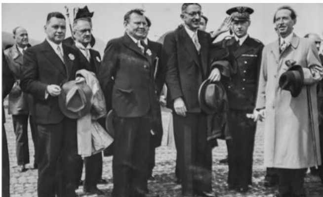
From the laying of the foundation stone on March 8, 1946, to the construction of the runway and towards the official inauguration on May 8, 1946

8 May is an historic date as it marks the end of the Second World War in 1945. And it is also a significant date for the Basel-Mulhouse Airport. Exactly one year after the war ended, on 8 May 1946, the Blotzheim airfield – known as Basel-Mulhouse Airport since the signing of the Swiss-French treaty in 1949 – was inaugurated after a construction period of just three months. After 75 years, the bi-national airport – still a unique model for cross-border cooperation – remains an important partner that serves France, Germany and Switzerland.