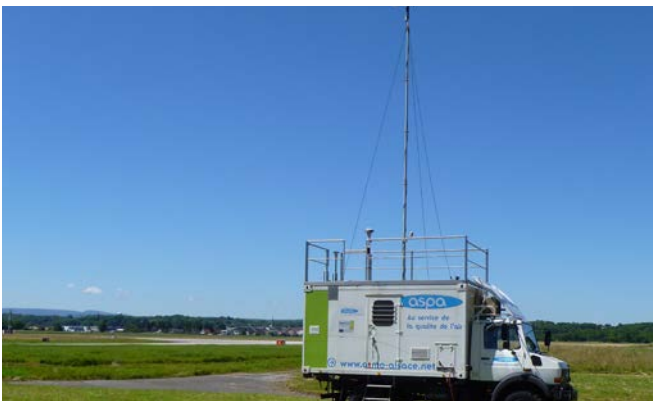
Mobile station for air quality measurement

Just in time for the summer holidays, restrictions are eased across national borders. Vacation planning, visiting family or friends – in principle, all become possible again. Vaccination and the recently implemented Covid passports or certificates make travel possible. But it's not a return to the old status quo. Travel regulations are still in force that require additional controls. This inevitably leads to longer waiting times at checkpoints for both departures and arrivals. An early arrival at the Airport is therefore strongly recommended. The particular legal status of bi-national EuroAirport poses challenges in implementing different requirements set by Switzerland and France. Even though Europe-wide harmonisation procedures were significantly improved compared to the first restrictions in 2020, the Airport faces challenges in continuously adapting the infrastructure to government specifications and in coping with increased passenger numbers.