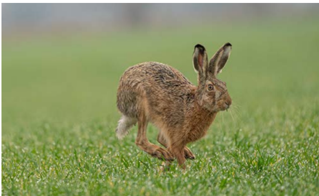
„Happy field hare“...

For the summer months, the Swiss cross can once again be seen on the tail fin of an aircraft at EuroAirport. This signals the return of a Swiss airline to Basel-Mulhouse after several years. Two Helvetic Airways aircraft are stationed at the bi-national airport: an Embraer E190-E1 and a brand-new Embraer E195-E2, also known as the Green Machine. This is one of the quietest and most modern short-haul aircraft currently in use; it consumes up to 25 per cent less fuel per flight and is significantly quieter.