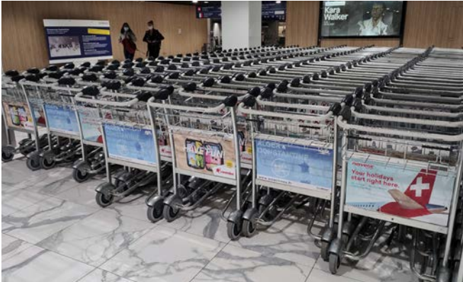
The baggage carts are ready to go