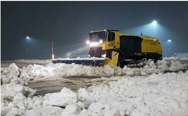
In action around the clock, 24/7: the airports snow removal teams

More snow than seen in years... – lots of work for the snow removal teams