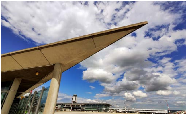
At the Airport, view from the tarmac to the terminal building

Omicron on the rise; flight cancellations soar