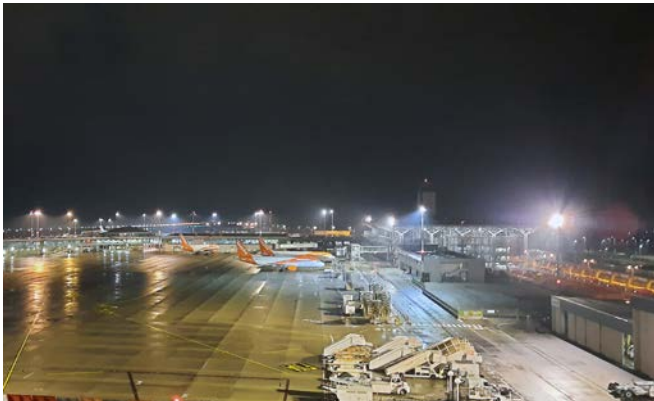
EuroAirport by night

August is by far the busiest travel month. It is vacation time, the vaccination campaign is running full steam ahead and the number of positive cases is falling. More than 75,000 passengers are welcomed to the Airport on the busiest weekend of the month, which corresponds to 77% of the traffic volume on the equivalent weekend in 2019. This leads to longer waiting times on an ongoing basis: this is due to COVID restrictions still being in place, which require numerous documents to be submitted and checked. On average, travellers have to plan in three times as much time for check-in than prior to the pandemic.