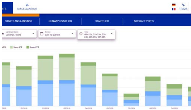
WebReporting - EuroAirport Basel Mulhouse Freiburg

WebReporting goes online at the start of September. This online tool provides visitors with up-to-date access to noise and flight operations statistics on the Airport's website. The data can be viewed up to ten years retrospectively. It is regularly updated in accordance with the relevant reporting interval (monthly, quarterly, annually). In addition to the data mentioned, statistics on related topics are also included, such as exceptional permits for night flights. WebReporting is a recently developed tool enabling the Airport to retrieve noise and aircraft movement statistics rapidly, in detail and interactively. It is a supplement to TraVis: since October 2020, TraVis has enabled the visualisation of flight trajectories, the retrieval of the associated noise values and the submission of complaints via the Internet. The two online tools allow the Airport to fulfill its commitment to publish the most important environmental data transparently and promptly.