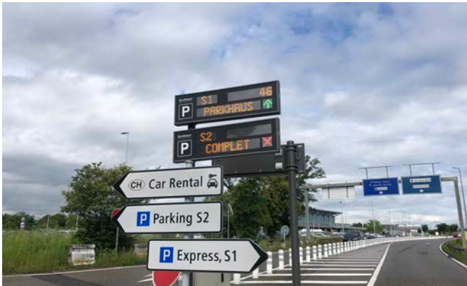
Coveted parking lots