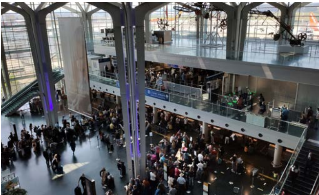
Waiting for check-in