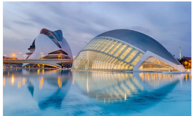
Valencia, Spain: «City of Arts and Sciences»

As the pandemic progresses, there are grounds for cautious optimism that travel restrictions will be eased. EuroAirport's 2021 summer schedule encourages travellers to visit friends and relatives, and to fly to numerous European cities and vacation destinations in the Mediterranean region. More than 90 destinations are offered in total, including new destinations like the capitals of Moldova and Albania – Chisinau and Tirana – which were delayed for a year due to the pandemic, or Valencia in Spain or Palermo in Sicily.