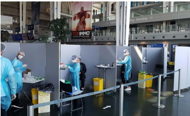
The Covid-19 test centre in the Airport's public area

The month that traditionally sees the lowest demand lives up to all expectations in 2021. With 71,000 passengers, it remains bottom of the table for the year. And the pandemic reduces demand even further.